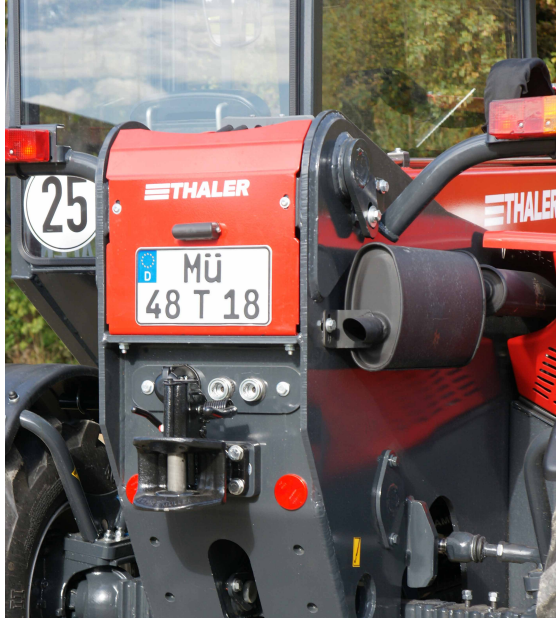
Automatic hitch with clevis