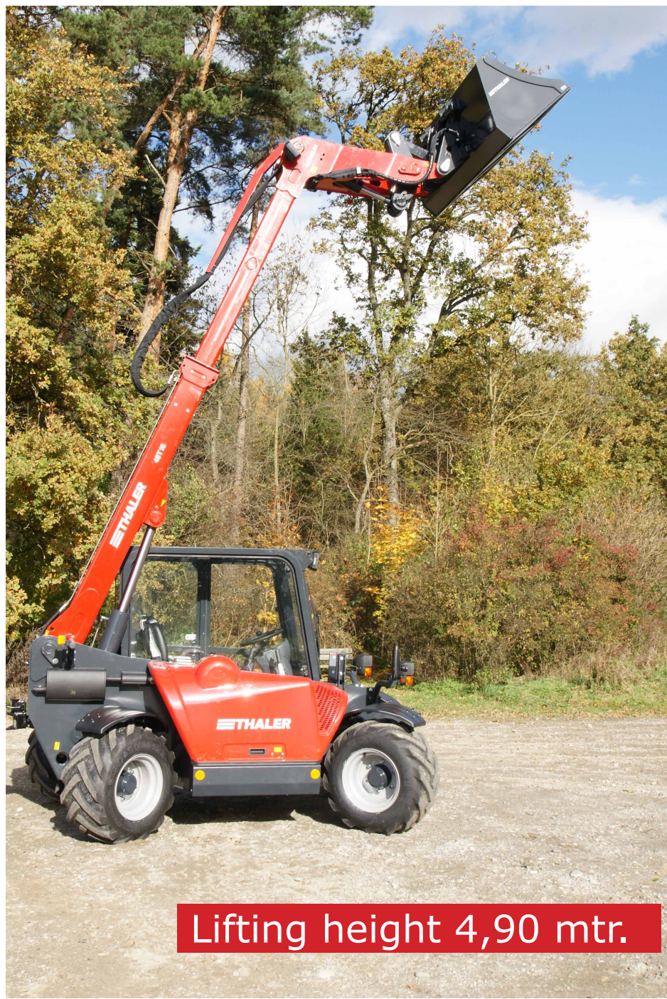
Lifting height 4,90 mtr.